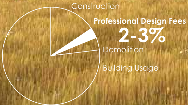
Building Life Cycle Costs in Perspective